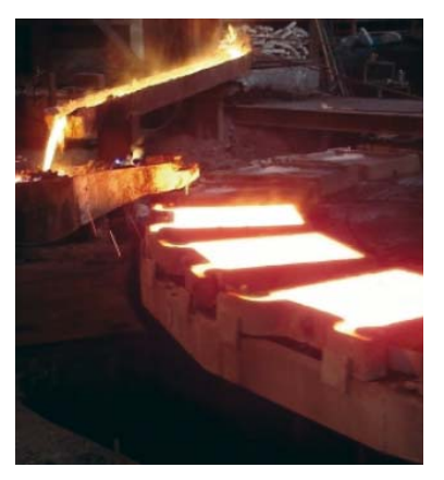
Figure 4: Refining practice: in a developed countries (left), developing countries (right)