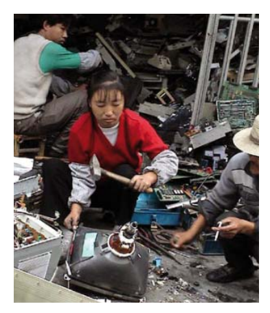
Figure 2: CTR removal in the dismantling step: safe practice in Switzerland (left), hazardous practice in China (right)