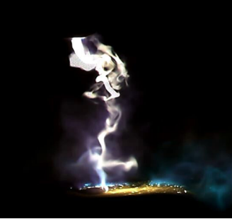
Fig. 1. High-speed photographs of DC arcs: the power of lightning.

furnace is generally controlled from hoppers or storage bins integrated with a mass loss system to monitor and adjust the feed rate and feed ratios to the required levels. Mintek uses continuous, accumulative calculation and manages the power-to-feed balance ratio throughout any given feed period (expressed as how closely the actual power-to-feed ratio is relative to the desired process ratio, i.e. net energy in/mass fed). While the aim is to be perfect at all times, this is obviously never true. This practice can be described via navigational principles applied by pilots. The basic control philosophy described is applied by pilots and furnace operators alike: implement corrective action by evaluating progress against target (Figs. 1 and 2).