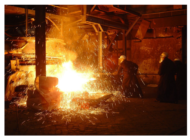
Fig. 2. Tapping the cauldron (pilot furnace) at Mintek (photograph by Geldenhuys, Mintek, 16 April 2004).

Scenario (c) illustrates a case where the pilot adjusts the direction regularly (comparing the actual progress relative to the destination) and over time a change in heading occurs. The aeroplane is not actually flying a "straight course", but rather a funny curved path. At least the aeroplane will arrive at the desired destination, even if not completely efficiently. If drift occurs, the furnace